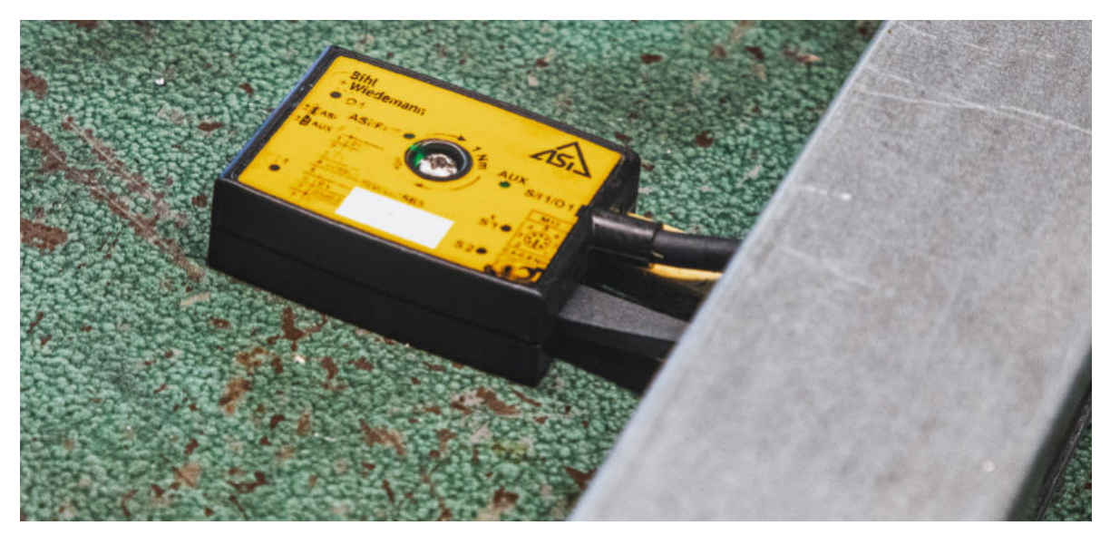
Active Distributor ASi Safety (BWU3565) in IP67 for simple, fast and safe integration of a door switch into the ASi network using the profile cable.

How foresighted the decision was to use AS-Interface for the safety technology and the monitoring of pressure, temperature and flow became evident in 2019. It was then that SPAX made the decision to make their production Industry 4.0 capable. In this context the main-tenance department at SPAX was also given the assignment to develop a concept for making the presses and rollers ready for Predictive Maintenance. The goal was to get more information from the machines about their condition and feed this information into an IT solution using a standardized protocol so that the current condition of the machine and, when needed, any action recommendations could be derived. Ideally this would involve as few modifications to the existing configuration of the presses and rollers and their control cabinets as possible. After deep-diving discussions and tests a solution was developed together with Bihl+Wiedemann that could be implemented while meeting nearly every formulated requirement. A contributing factor was that at the end of 2018 with ASi-5 the newest AS-Interface generation was brought to the market, which is downward compatible with all previous ASi generations, has the necessary high data bandwidth and short cycle times for sending even the data from IO-Link sensors. In addition, Bihl+Wiedemann has in the meantime equipped all their new ASi gateways with an OPC UA interface for making the data directly accessible to the IT while bypassing the controller.