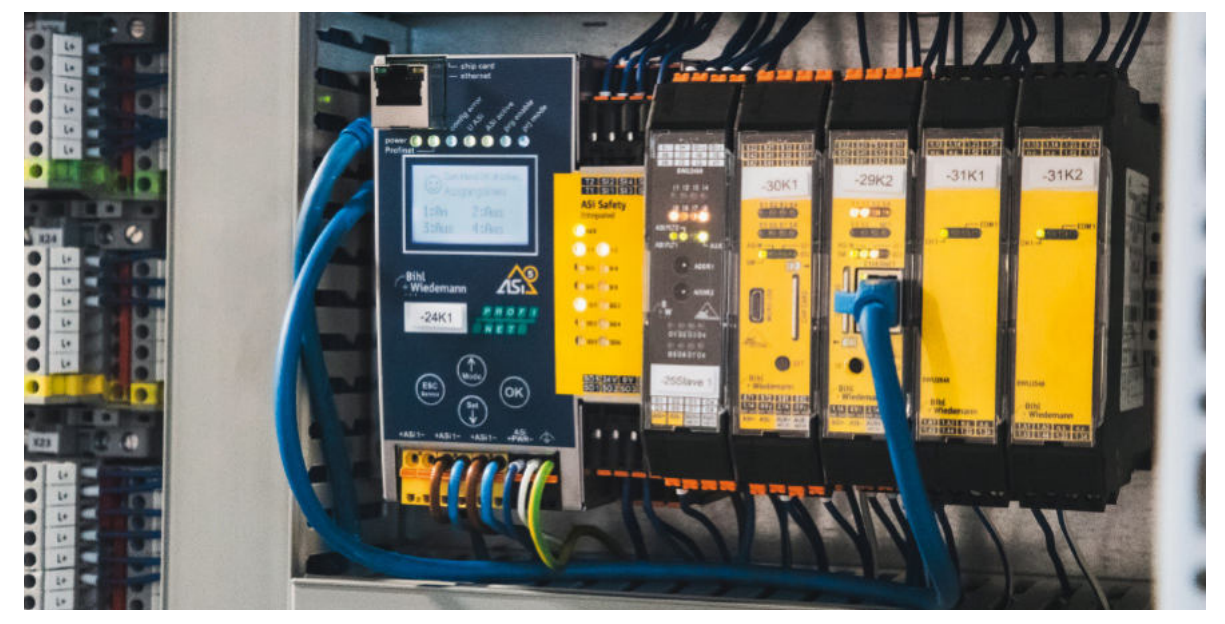
Safety technology in the control cabinet: ASi Safety Gateway (left) and Safety Basic Monitors (center) from Bihl+Wiedemann.

In addition to safety technology, another topic solved by AS-Interface was the monitoring of pressure, temperature and flow. Especially when it comes to presses and rollers, where proper lubrication of the machine is always critical for efficient functioning and to prevent damage, these parameters need to be continuously monitored. Here the decision was made early to employ the ASi digital modules from Bihl+Wiedemann, since they can be used in parallel with the safety technology on the same cable and monitored via the same ASi gateway.