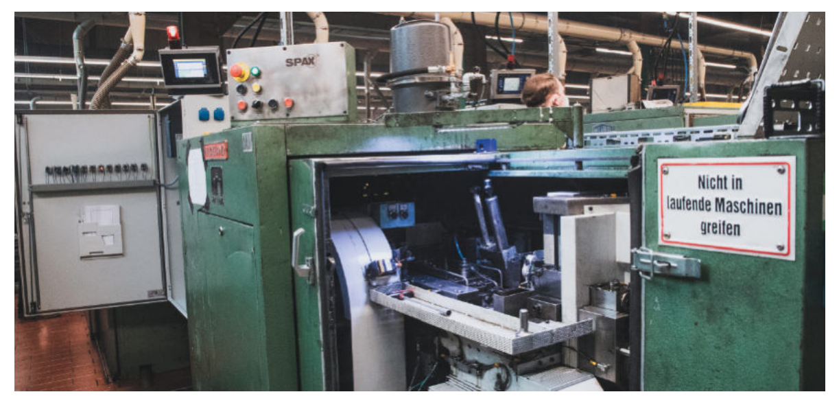
Press with control cabinet.

program for a machine has been saved in the ASIMON360 software suite, it can be easily copied for use in other machines. Finally, the result is that things are made quite easy for personnel who are responsible for maintenance and modernization of the presses and rollers, for example when it comes to troubleshooting. Why? Because they can apply the knowledge about ASi and ASi Safety learned in regular training courses with Bihl+Wiedemann outside sales persons directly from one machine to another. "The cooperation from our colleagues at Bihl+Wiedemann that we have experienced here in the SPAX electronics workshop is really something special," says Sascha Roloff. "Regardless of whether we're bringing our people up to speed on the newest state of AS-Interface, working together on the best solution, or testing new developments – such a partnering relationship from both sides and the advances made are something one seldom experiences."