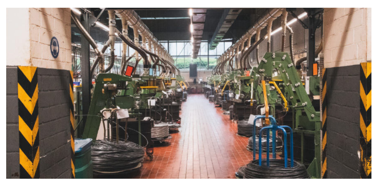
SPAX uses a variety of identical or similar machines for manufacturing screws.