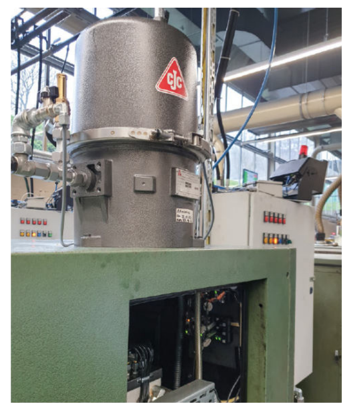
Process and diagnostic data from IO-Link sensors for pressure, temperature and flow can now be used in ASi-5 for predictive maintenance.