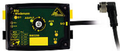
Fig. 3: Active distributor (BW3299)