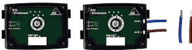
Fig. 4 : AUX Passive Distributors (BW3306, le., BW3307, ri.)