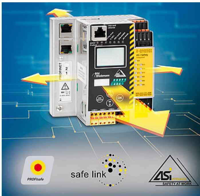
Fig.1: AS-i Safety PROFIsafe Gateway with integrated Safe Link for safe coupling (BWU3367)

Would you like to experience live our ideas and new products? You are welcome to visit us from April 25-29, 2016 at our booth H01 in hall 9 .