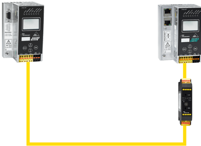
Fig.3: Easy data exchange regardless of the fieldbus used