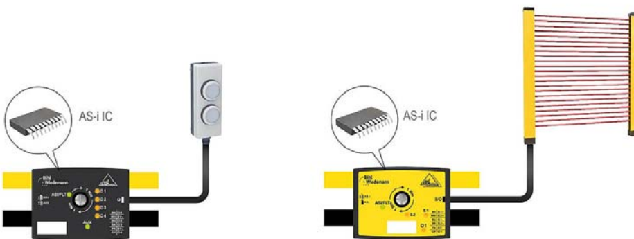
Fig. 2: active distributors AS-i for incorporating standard sensors, buttons or switches (left), Active distributors AS-i Safety for incorporating safe sensors, buttons or switches (right)

Are you searching for a simple installation and bus system for your plant but don't want to sacrifice the proven sensors, buttons and switches? With active distributors you can make any component AS-Interface (AS-i) capable and use them with no restrictions in the simple, robust AS-i bus system. Even a sensor without an AS-i connection can be integrated into existing AS-i networks.