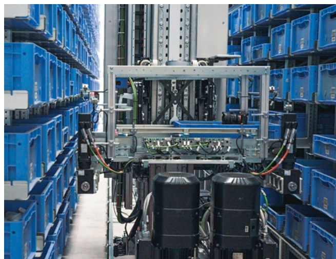
S/RM in aisle with material handling technology (left), LHD unloading a compartment (right)