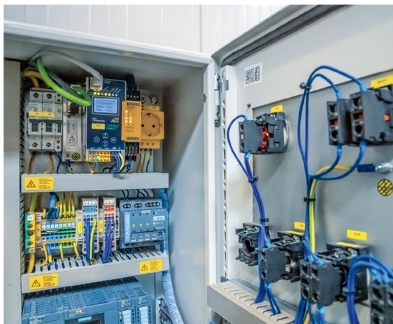
Aisle door (left), control panel with Bihl+Wiedemann safety technology