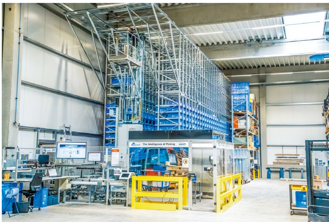
Klinkhammer application: Stacker crane with high rack storage

And the safety technology, even for larger material handling applications, is ideally implemented using ASi Safety according to A. Ruhmann, since it is often the case that only the data from simple sensors needs to be collected but from widely different locations in the field. "Light barriers, here and there a safety light curtain, every few meters an E-STOP button, perhaps a protective door or two – ASi Safety is simply perfect for this, especially in the field of material handling".