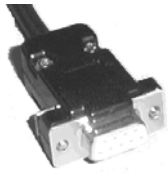
ASi Master in IP65 (Specification 2.0)